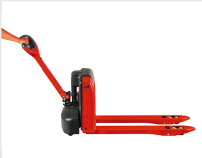
Long low mounted tiller ensures safety distance