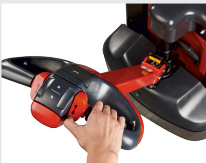
All controls ergonomically integrated in the Linde tiller head