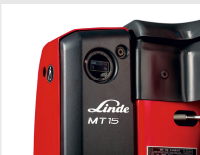
Intuitive multifunctional display