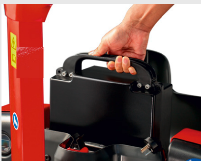
Easy plug and play Li-ION battery