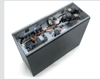
Multi-level safety concept