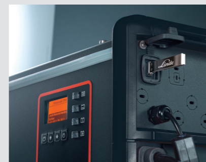
Easy service access