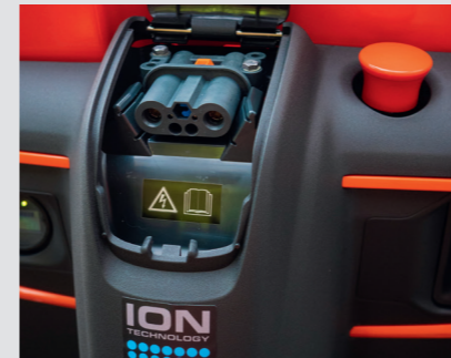
Quick access for vertical or lateral charging