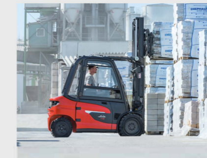
X35 equipped with Li-ION battery