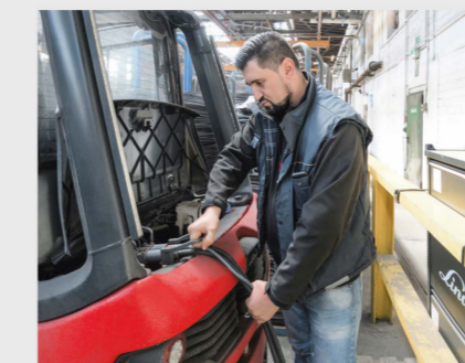
Quick access to charge